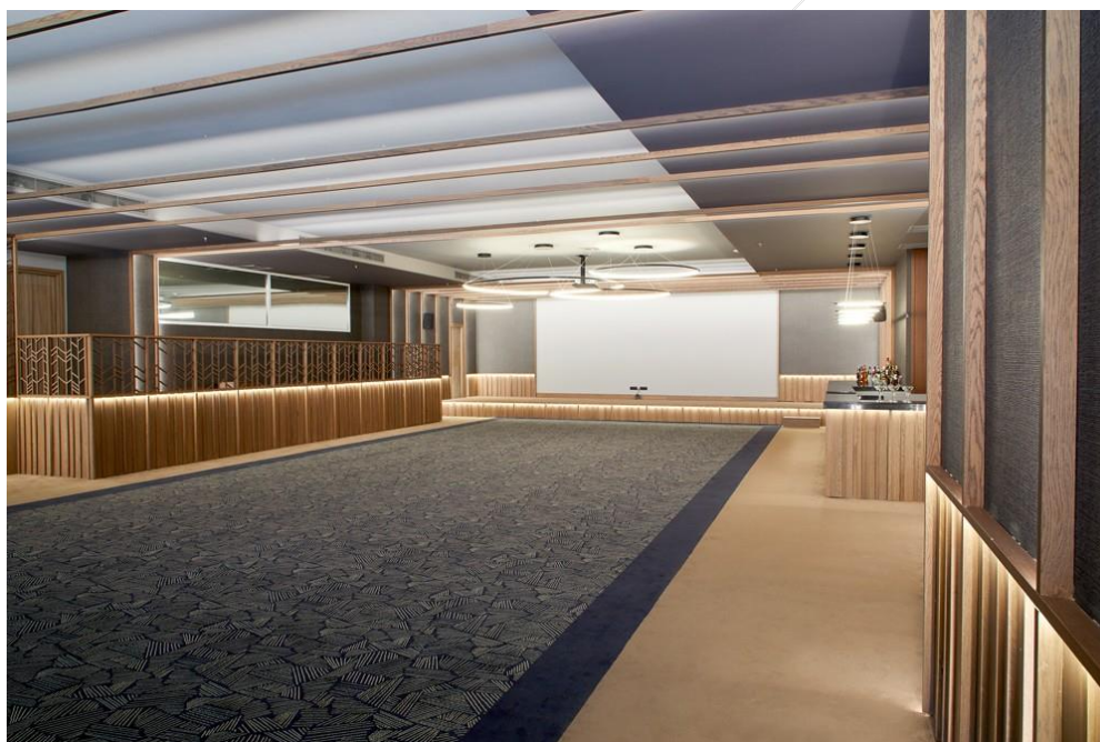
Meeting Venue of the Wyndham Grand Mirabello

The contemporary conference premises of Wyndham Grand Mirabello represent the Cretan cornerstone and offer an ideal venue for professional meetings. The hotel has the privilege of being surrounded by two shining sandy beaches, which have been proudly honored with the "Blue Flag Award".