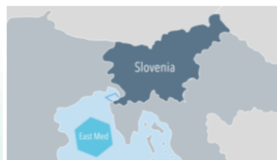
— Territorial Sea (TS)