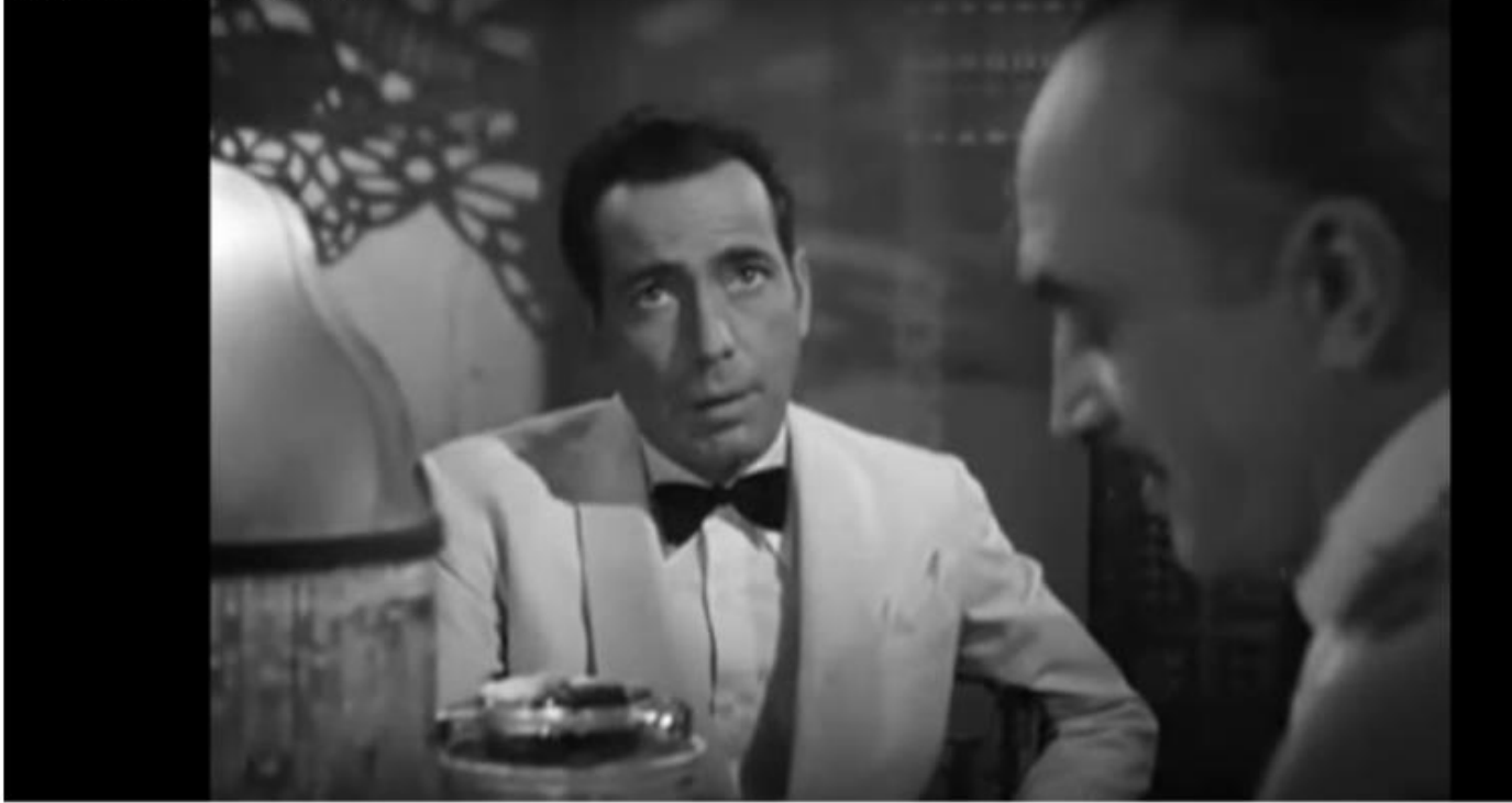
Casablanca I'm a drunkard