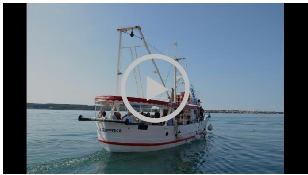
Conference on EU Macro-regional Strategies, Media and Communication - Highlights