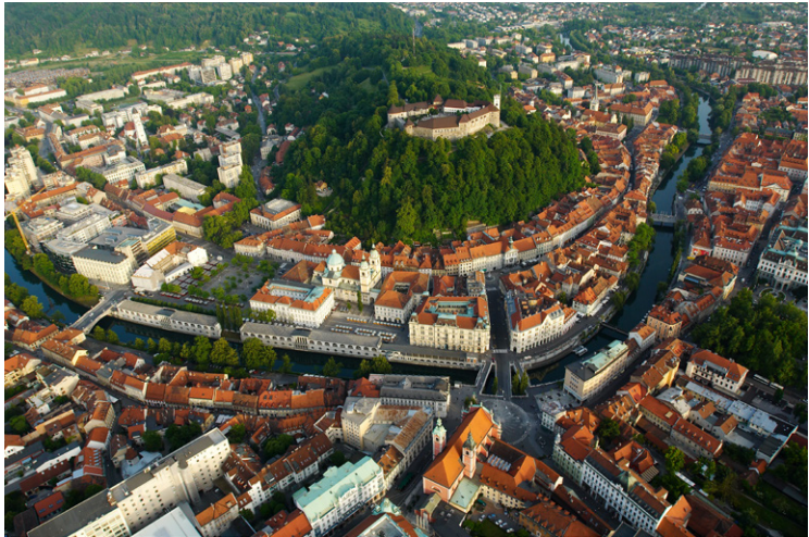
The Slovenian capital Ljubljana