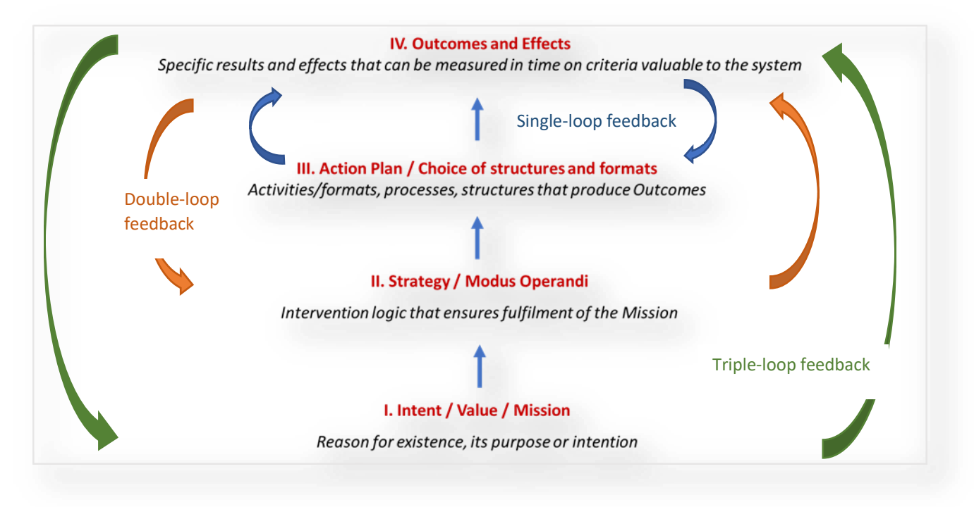
Figure 4. Four levels of a system

The strength and performance potential of the system depends on how well the levels are designed and on the degree of its internal coherence. Systems theory says, the system can learn from "seeing itself in action", through feedback loops .