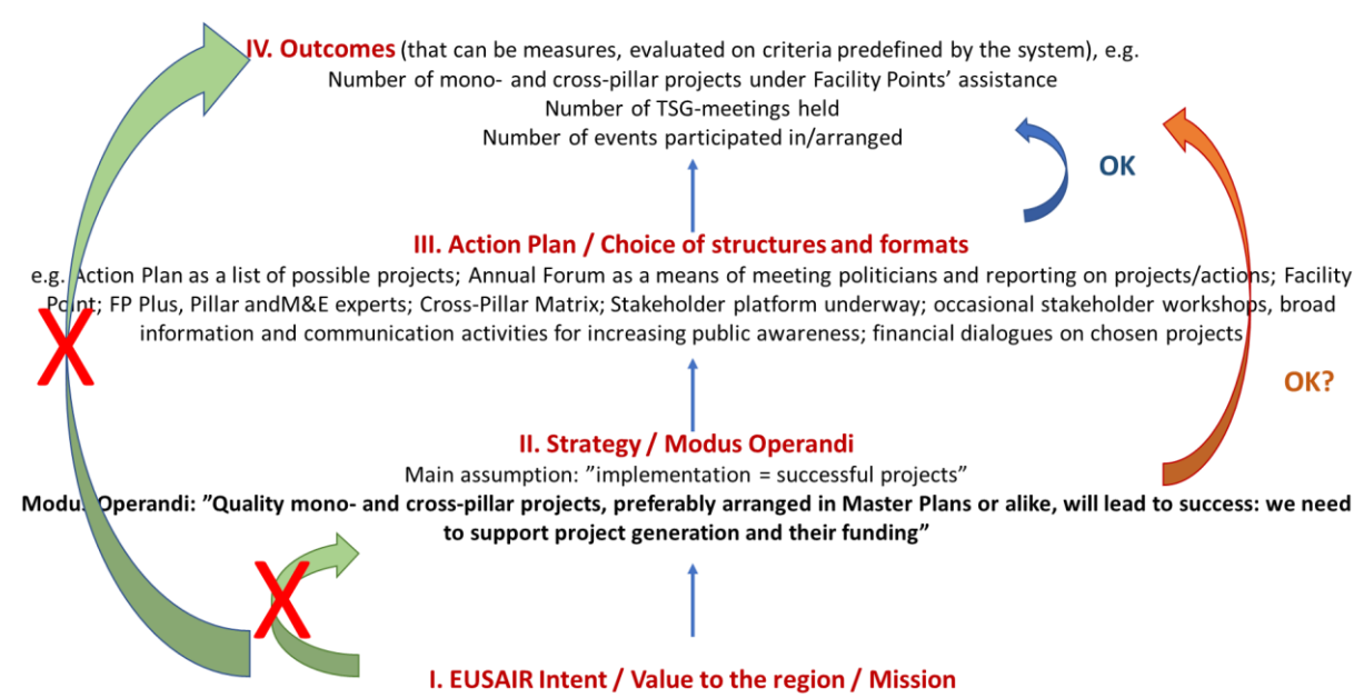
Figure 6. The EUSAIR system today

The EUSAIR is a trustful connection between the political and administrative bodies and the people. It is there to strengthen the foundational prerequisites and remove structural barriers for multi-stakeholder, cross-sector collaboration in the areas of common concern or opportunity. In the quality of collaboration lies its innovation potential.