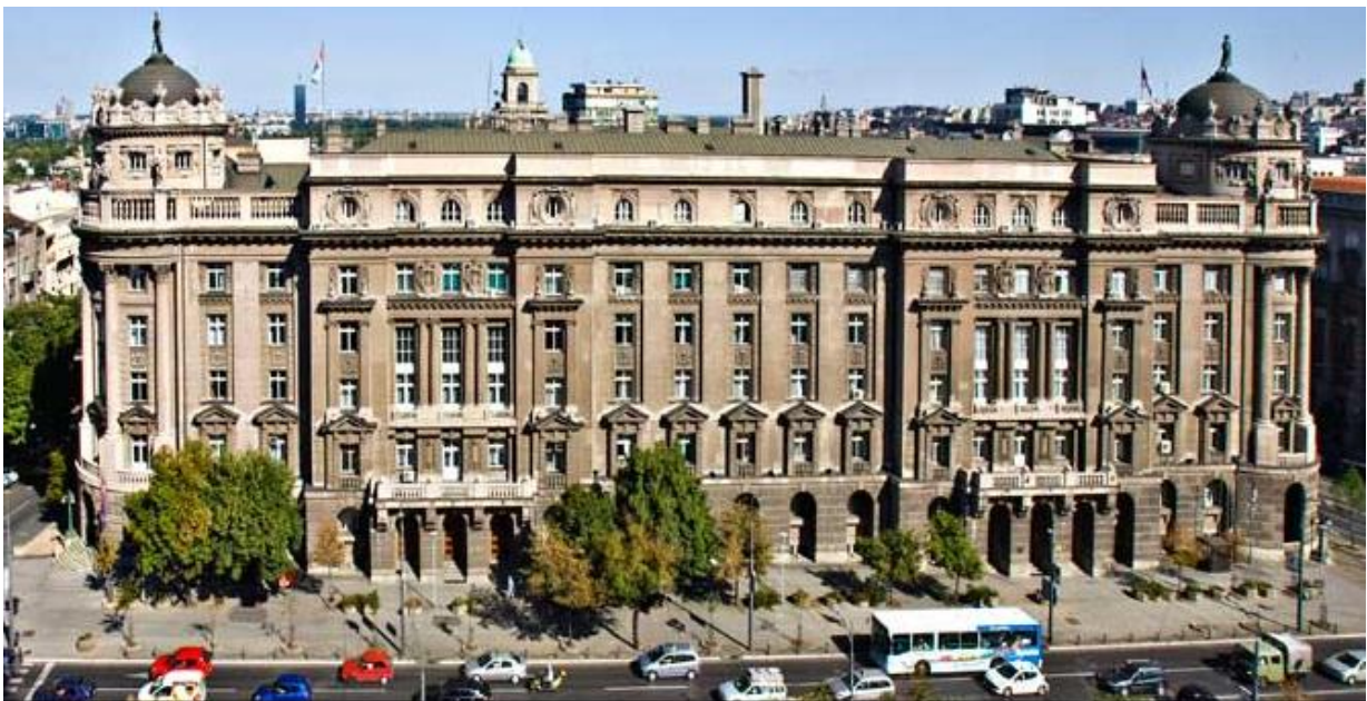
Venue building: the Ministry of Foreign Affairs of the Republic of Serbia

The 11th EUSAIR TSG2 meeting will take place in the Ministry of Foreign Affairs in Belgrade (address: Kneza Miloša 24-26, 11000 Belgrade), Serbia, see on google map . Entrance on street No 24. should be used.